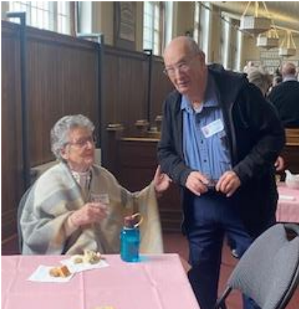
Additional photos from the Moderator's visit to First United Church.