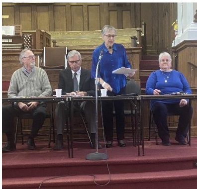
The Profile Team presents its report.

Come and be a part of our mission! There is room for all!